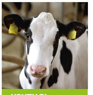
YOUTH Phase 5 - 8 months